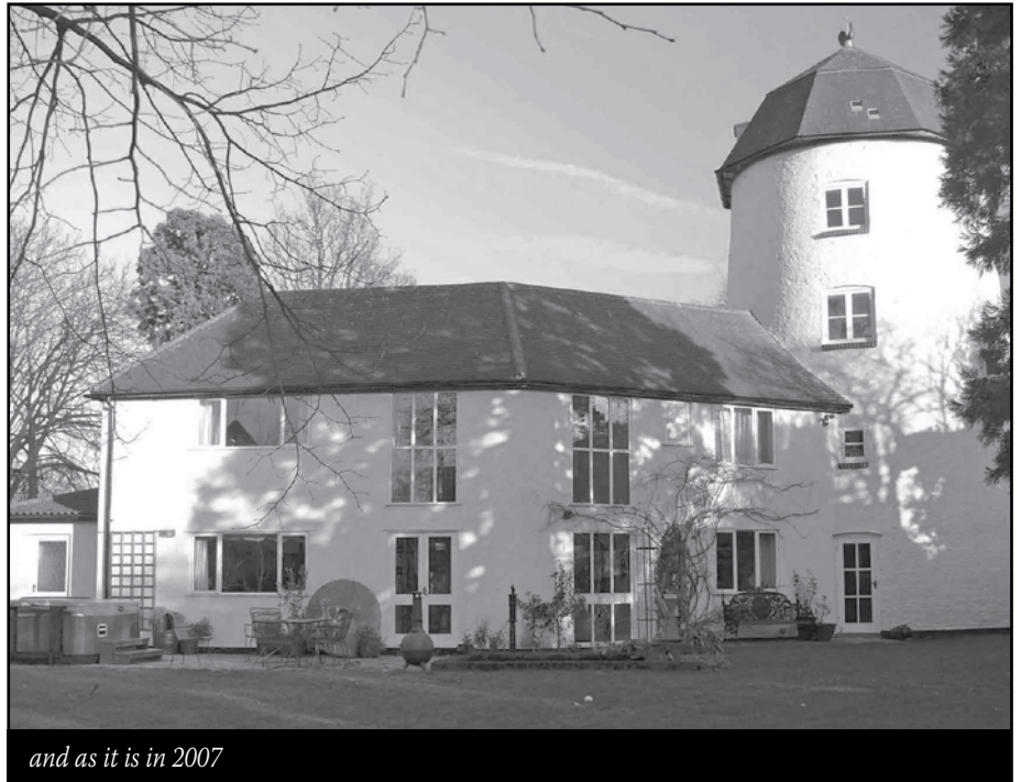
and as it is in 2007