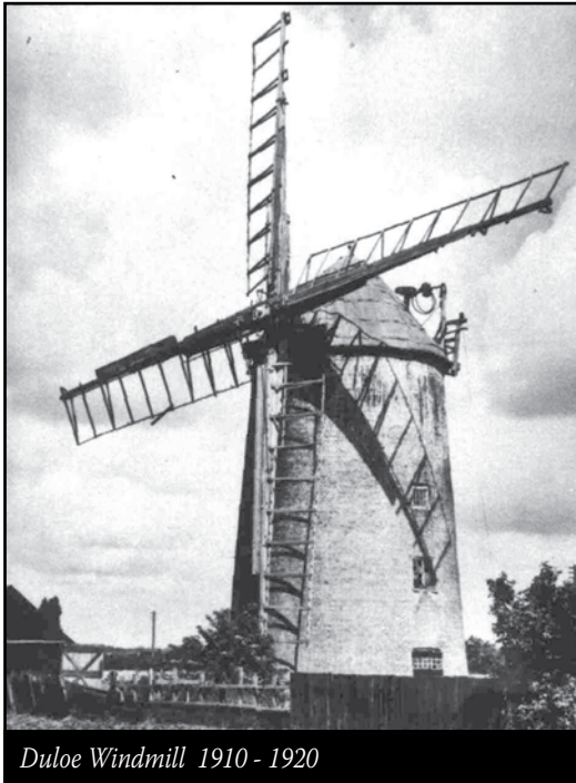
Duloe Windmill 1910 - 1920

Below you can see two images of the Duloe Windmill, we hope it will make everyone aware of the importance of recording our history, as gradually old photographs of buildings and people are not thought not to be so important in this modern day and are being lost along with records of our history.