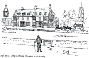
THE COCK INN, EATON SOCON (Based on an old drawing)